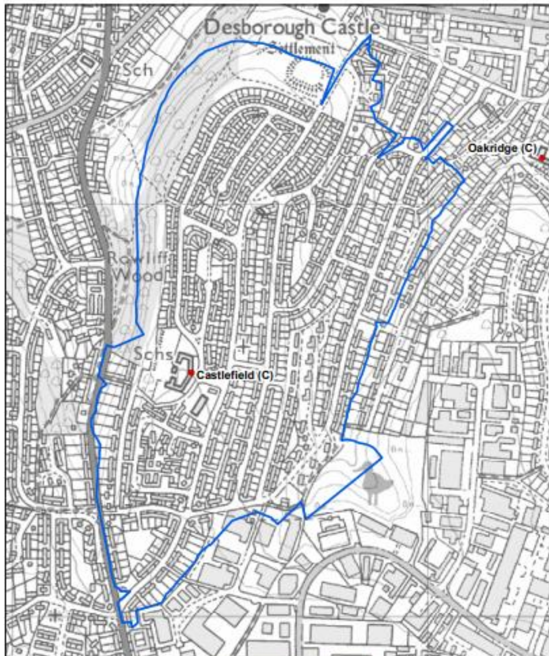
Catchment Area for Castlefield School