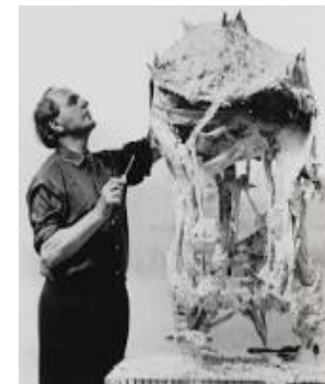
Henry Moore with some of his works.